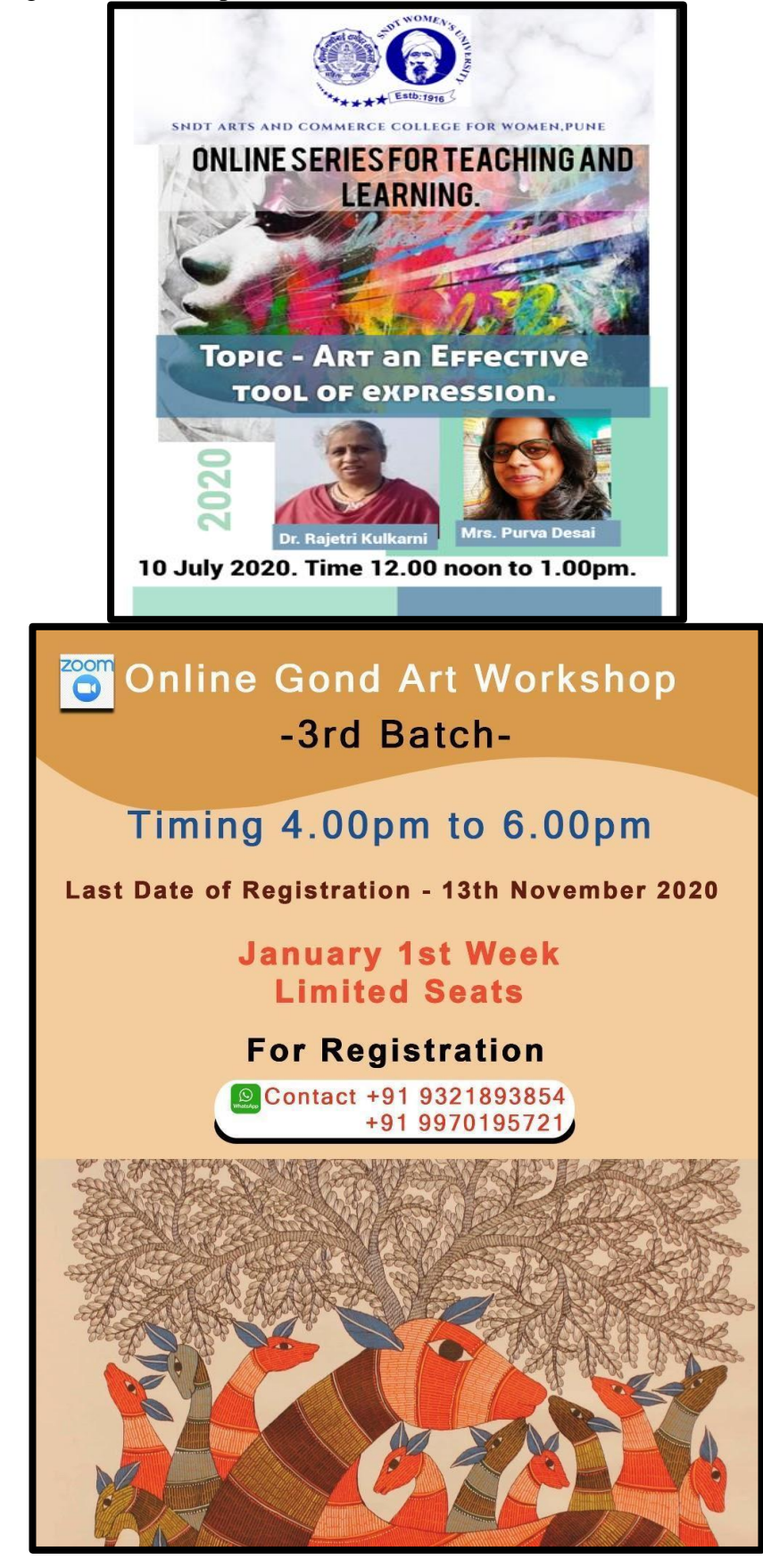
SNDT Arts and Commerce College for Women, Karve Road, Pune

,Pune.Students from Mumbai and Nashik attended the program. Apart from this, Teachers' Day, Teachers' Meetings, Parents' Meetings as well as supplementary lectures etc. were also organized in the department.